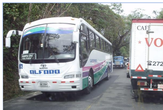
Bus to Santa Cruz via Puente, Guanacaste, Costa Rica

TAMARINDO BEACH: $8; 11:30 a.m. and 3:30 p.m.; 6 hours. Departs from the intersection of Avenida 3 and Calles 14/16 (Alfaro Terminal). 2222-2666.