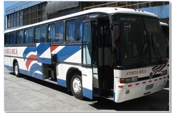
Bus to Tarrazú, San José, Costa Rica

ALAJUELA: (Airport): $0.75; every 10 minutes 4:20 a.m.-11:00 p.m.; after 11:00 p.m. buses depart every 30 minutes for the airport; 30 minutes. Departs from the intersection of Avenida 2 and Calles 12/14. 2222-5325.